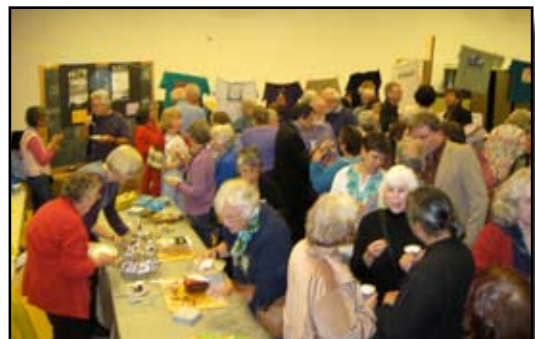
Friday Night Volunteers Concert mingling