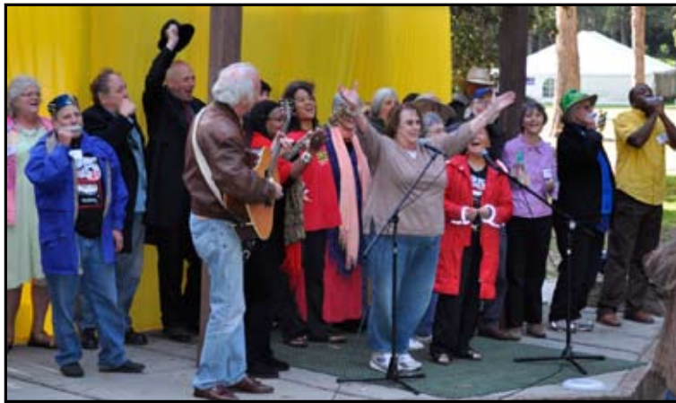
Sunday's Closing Festivities.