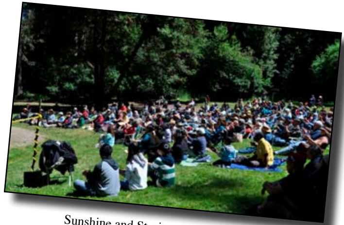
Sunshine and Stories at Kennedy Grove