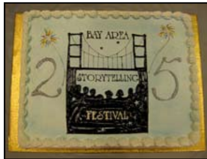
The Cake Tells Our Story!