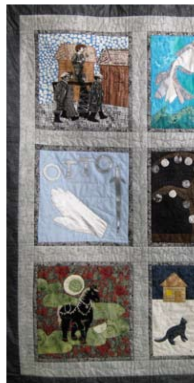
BASF's Silver Anniversary